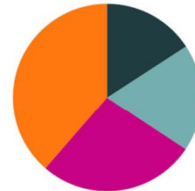
Practicum Exam (PRAC 2.0) 120 Questions | 4 Hours to Complete

EXAM SUBJECTS: Programming and Site Analysis Codes and Standards Building Systems and Integration Contract Documents