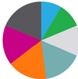
Interior Design Professional Exam (IDPX) 175 Questions | 4 Hours to Complete

EXAM SUBJECTS: Professional Business Practice Building Systems and Integration Contract Administration Project Coordination Contract Documents Product and Materials Coordination Codes and Standards